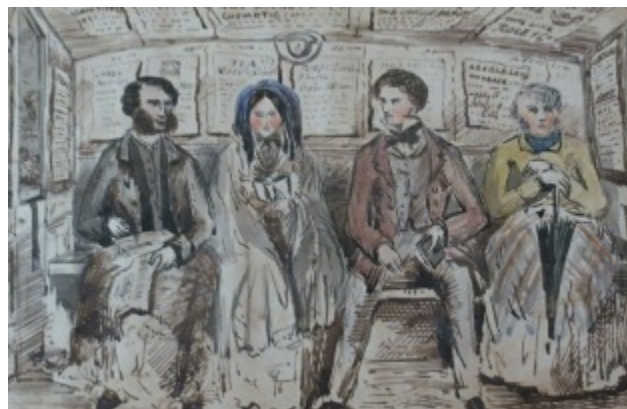
drawing by Thomas Moxon in 1855 of passengers on the Great Eastern Railway